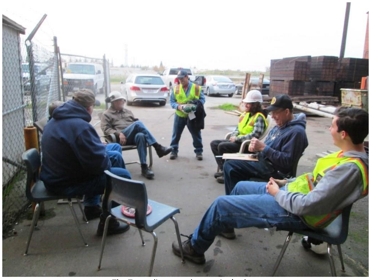
The Team discusses the evening's plans